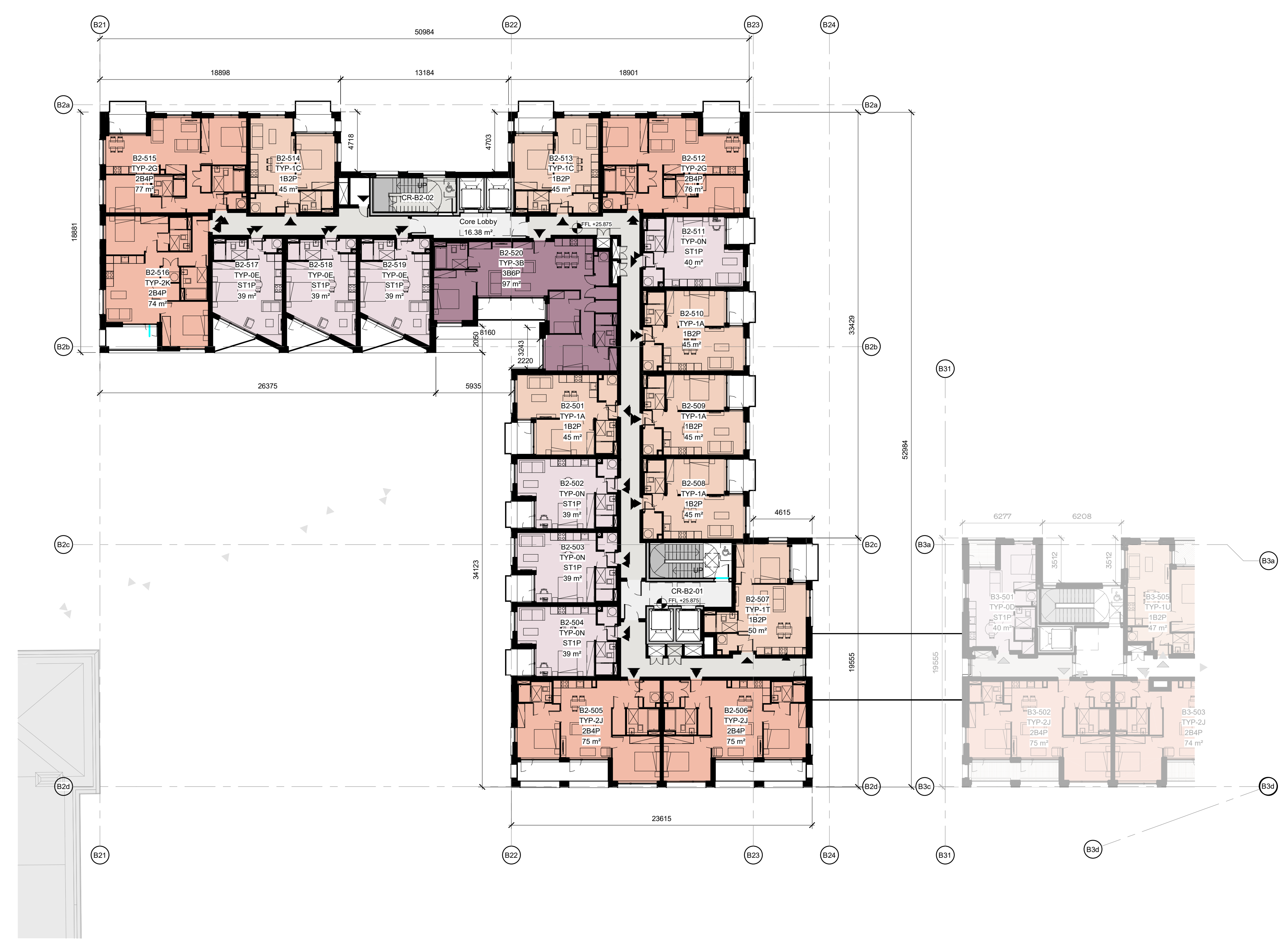
2 BLOCK B2-LEVEL 05 1: 200