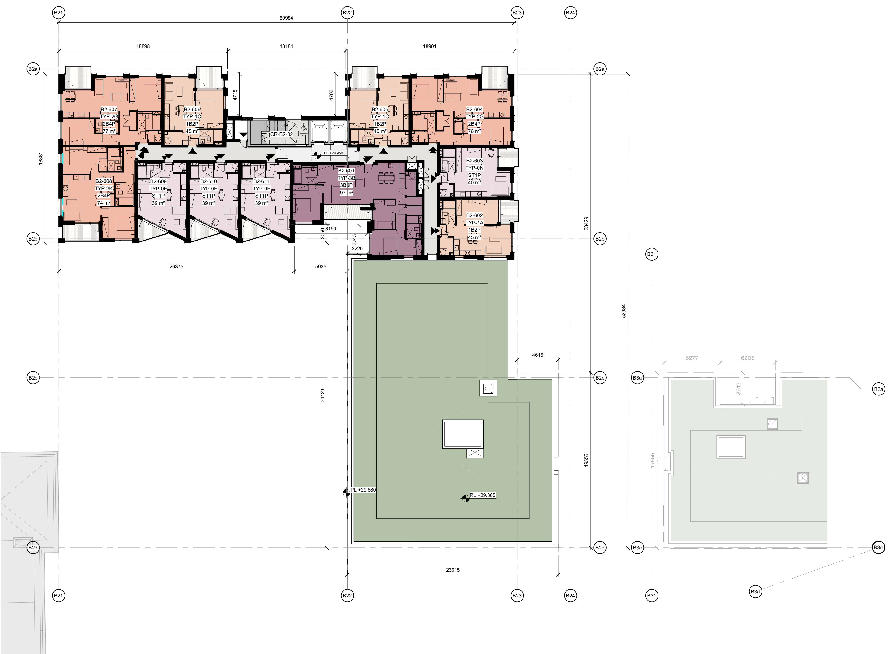
3 BLOCK B2-LEVEL 06 and 07 1: 200